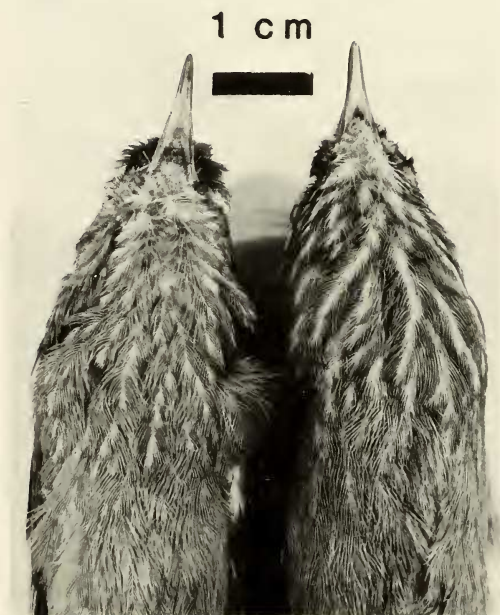
Fig. 1. Ventral view of typical specimens of Siptornis s. striaticollis (left; ANSP 155471 ♂, La Candela, Dpto. Huila, Colombia) and S. s. nortoni (right; type).

Characters. —Compared to S. s. striaticollis , the buffy central stripe on the feathers of the upper breast of S. s. nortoni are much wider and longer (Fig. 1) The white subocular spot and scattered white feathers on the forehead of S. s. striaticollis are largely absent in S. s. nortoni ; white facial feathers